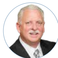
Robert C Barchiesi President, The International AntiCounterfeiting Coalition (USA)